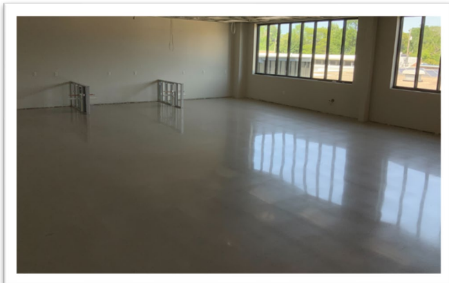
Floor polishing is complete in the new art room.