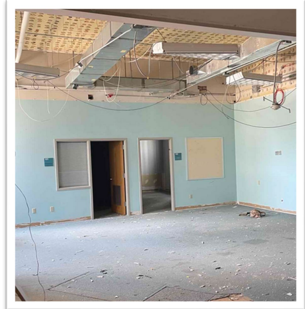
Demolition has started in classrooms throughout the building.