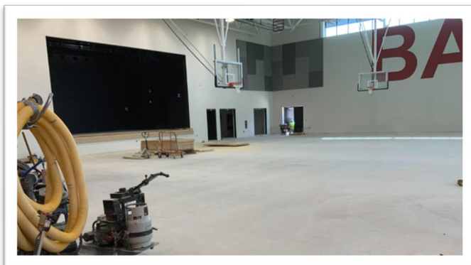
Gym floor base is being prepped for wood flooring.